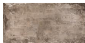
20x40 Brick Lane Cotto € 29,24 mq ■ 14