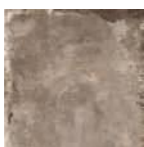
20x20 Brick Lane Cotto € 29,24 mq ■ 28